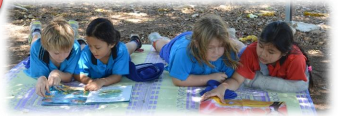
Buddy reading groups